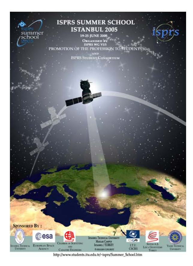
Figure 4. Poster of ISPRS Summer School 2005