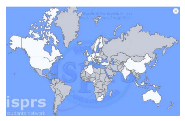
Figure 6. Distrubition of SC Members among the Countries

Distribution of Student Consortium members among the countries all over the world is graphically showed below.