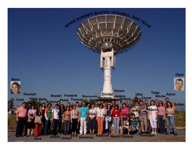
Figure 5. Participants of ISPRS Summer School 2005