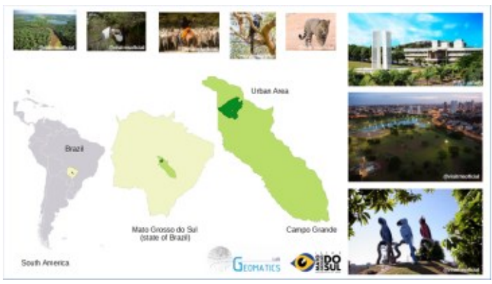
Location Map of the Mato Grosso do Sul State and its Capital - Campo Grande

Remote Sensing and Photogrammetry make it possible to map and to monitor resources through orbital images or through images collected with UAV. They also support precision agriculture, what leads to a greater productive efficiency, and reduce the need on use of pesticides. In this sense, it becomes of great importance to acknowledge what exists in the most recent researches (state of the art) both in the technological aspect and in the methods/techniques of Photogrammetry, Remote Sensing and Machine Learning.