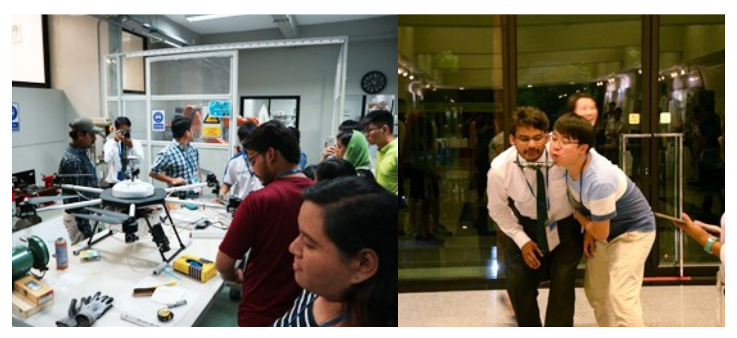
(Left) Visiting some of GISTDA's facilities related to space applications; (Right) During the ice breaker session where two participants were attempting to help their drone reach the target!

assisted by students from Burapha University. We tried to execute the drone point-to-point with simple coding.