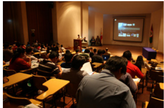
The participants of PhilGEOS during the Opening Ceremony

Twenty-three oral presentations and 5 five posters were presented in the symposium, in the following session themes: Geomatics Science and Engineering