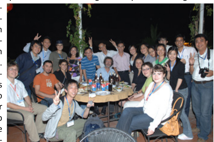
Group photo of the 5th ISPRS-SC Summer School 2010 in Vietnam

translation and social networking. Since last decades, the number of Asian students and young scientists aiming at this research area continues growing. These youths had well-organized local communities in some Asian countries to promote students for their professions. The next step then is to establish the connection between students from different countries for sharing interests and knowledge according