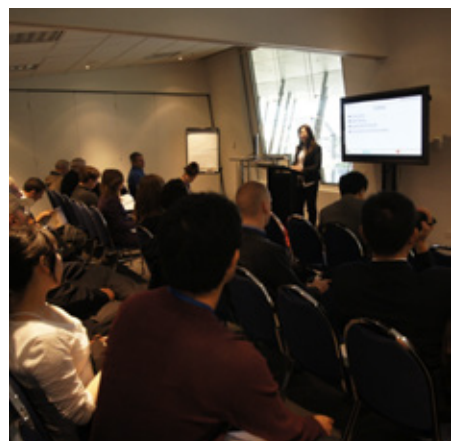
Technical session of Youth Forum

XXII Congress in Melbourne and had a huge success during 25 Aug. to 1 Sept. 2012. The XXII Congress provided a great opportunity to demonstrate the advancements and applications new technolo-