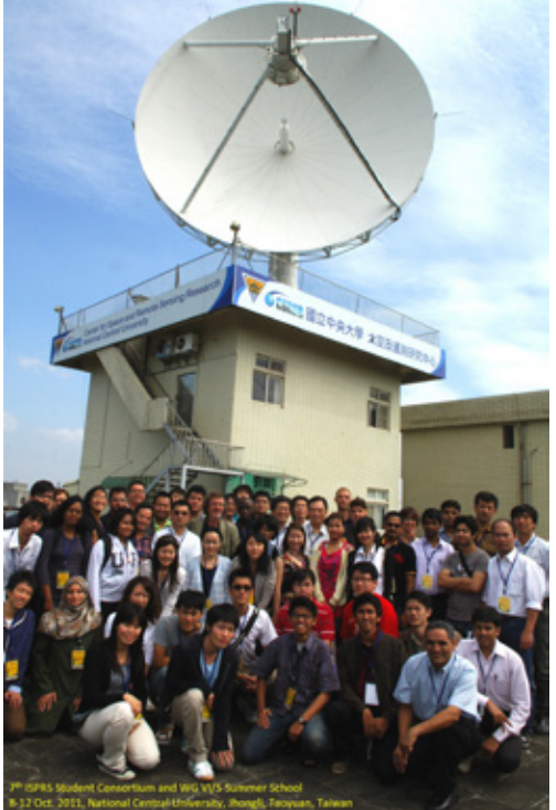
Group photo of the 7th ISPRS-SC Summer School 2011 in Taiwan

At ACRS 2011, student organizers held a student sesion to let youths introduce their research activities from different universities in Taipei, Taiwan. This event had seven student volunteers from five countries to introduce student activities and their universities. After their introductions.