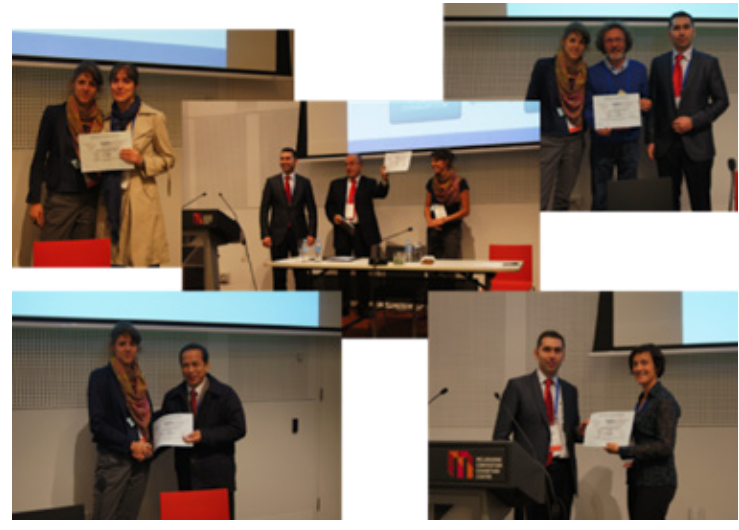
Certificates of appreciation

of Asian Association on Remote Sensing (AARS), for the network expansion. In addition, the African region is also a possibility to cooperate for the organisation of ISPRS-SC Summer School.