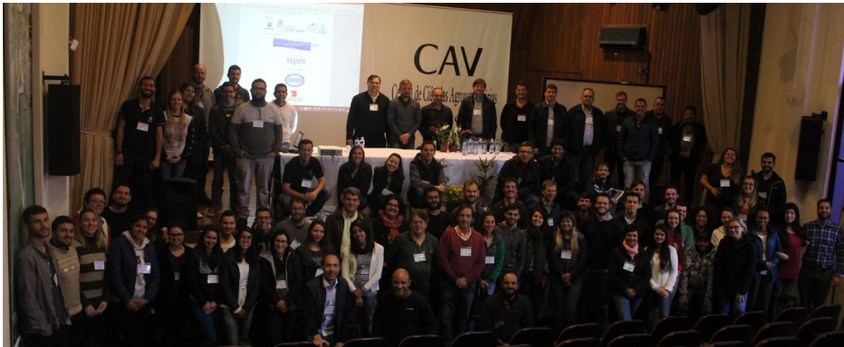
Figure 1. Group picture of the participants taken on the third day of the event.

harvested from vineyards located at over 1300 meters above sea level. The degustation was harmonized with different cheeses, also produced in the region. On Wednesday, in order to celebrate the success of the first block, traditional beers brewed in the region were appreciated at the famous “Boteco Santa Fé”.