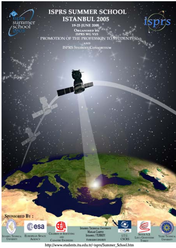
Figure 4. Poster of ISPRS Summer School 2005