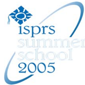
Figure 3. Logo of ISPRS Summer School 2005