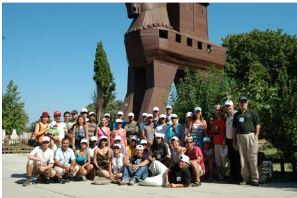
Figure 2. Summer Camp Participants – Troya 2004

39 students from 10 different countries has participated the summer camp. The participation of students to both professional and social activities was enthusiastic.