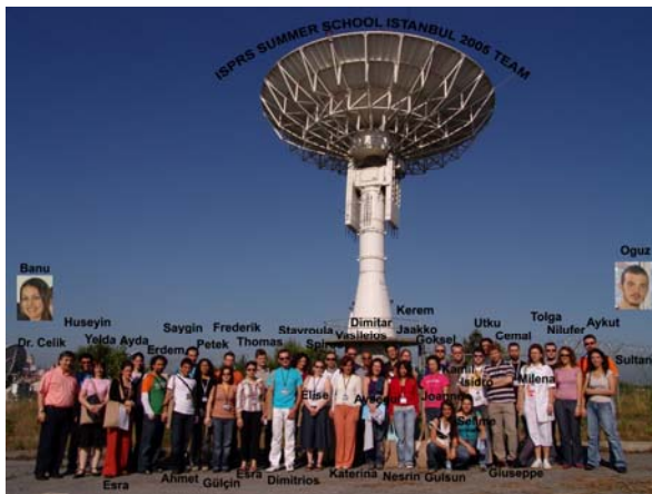
Figure 5. Participants of ISPRS Summer School 2005 (ISPRS SC web page, www.commission6.isprs.org/wg5 )