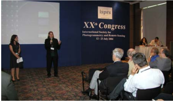
Figure 1. Youth Forum - ISPRS XX. Congress Istanbul